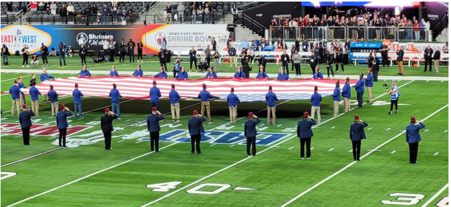
The Imperial Divan, representing all of us Shriners on the field, salute the colors during our National Anthem. At the East West Shrine Bowl