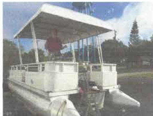
Watch for Bubbles!!

Monday July 4 Imperial Market Place Bridge, General Meeting Ladies Breakfast Lunch on your own Night Parade Dinner on your own Hospitality Room