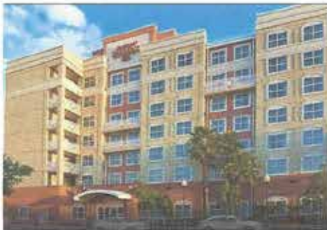
Marriott, Tampa Bay Downtown

Sunday July 3 rd Registration Imperial Market Place Church Service at Imperial Hospitality Room