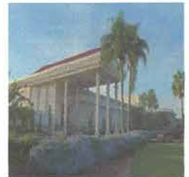
Egypt Temple Shrine, Tampa, FL

Sunday July 3 rd Registration Imperial Market Place Church Service at Imperial Hospitality Room