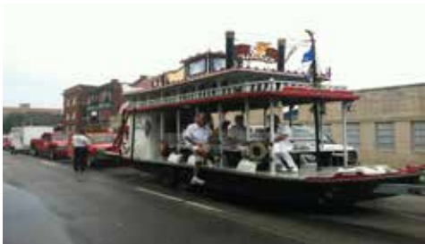
They serve who also stand and wait! We waited out the rain for the Imperial Parade and the show went on!

During the week, the Gortowski's had led attendees through a world wind of exciting venues including a tour of the Indianapolis 500 Race Track, the world's largest and one of the most exciting. On the day of the Indy 500 over 300,000 spectators attend the race. Even the newsroom is filled with some 500 radio, TV and print sports news reporters.