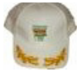
White Cap $12.00