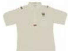
Knit Sport Shirt S,M,L $25.00 Others $35.00