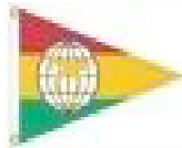
IASYC Burgee 12 x 18 $20.00