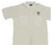
White Cotton Shirt $27.00

xxx Large Jackets - 1/3 off with super saver shipping!