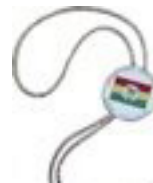
Bolo Tie $15.00