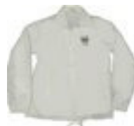
Wind Breaker Jacket $30.00