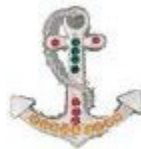
Fez Tassel Holder $15.00