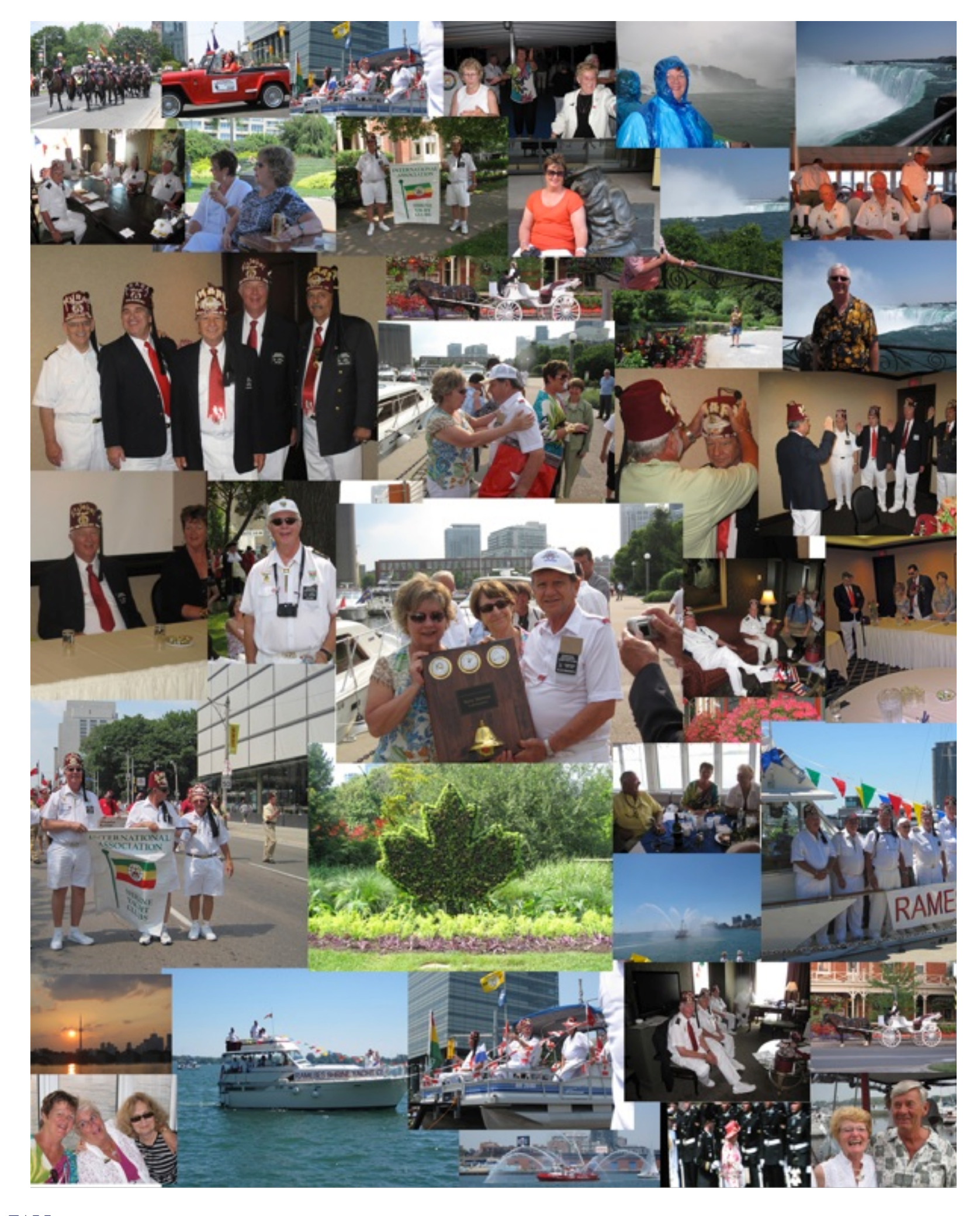
PAGE 9 FALL 2010 <u>WWW.IASYC.ORG</u>