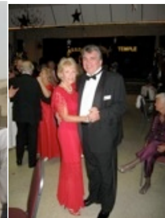
I could have danced all night!

Shrine Yachtsman (USPS 024195) is published quarterly by International Association of Shrine Yacht Clubs., 2325 15th Avenue, Longmont, CO. 80503. Mail at Periodicals Postage (Permit Number 024195) at Longmont, CO.