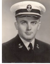
Robert Judson Gorton Sr.