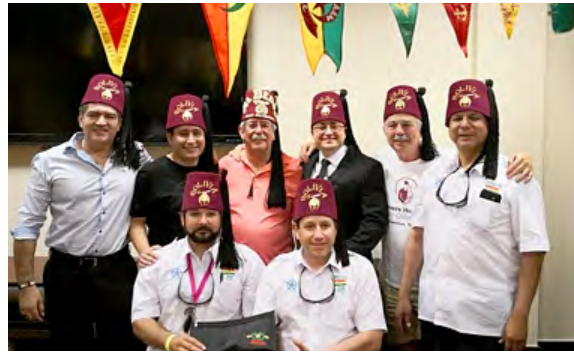
Bolivia Shrine Center Mariners Club in Bolivia