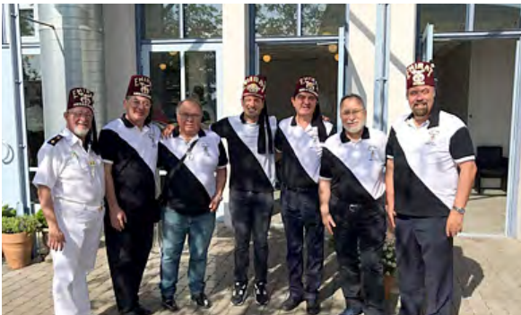
Emirat Shrine Center Yacht Club in Germany