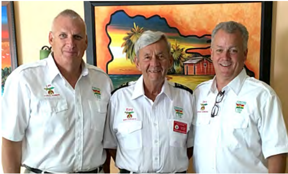
Karnak Shrine Center Mariners Club in Montreal, CA