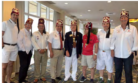
Hikmat Mariners Club in Brazil